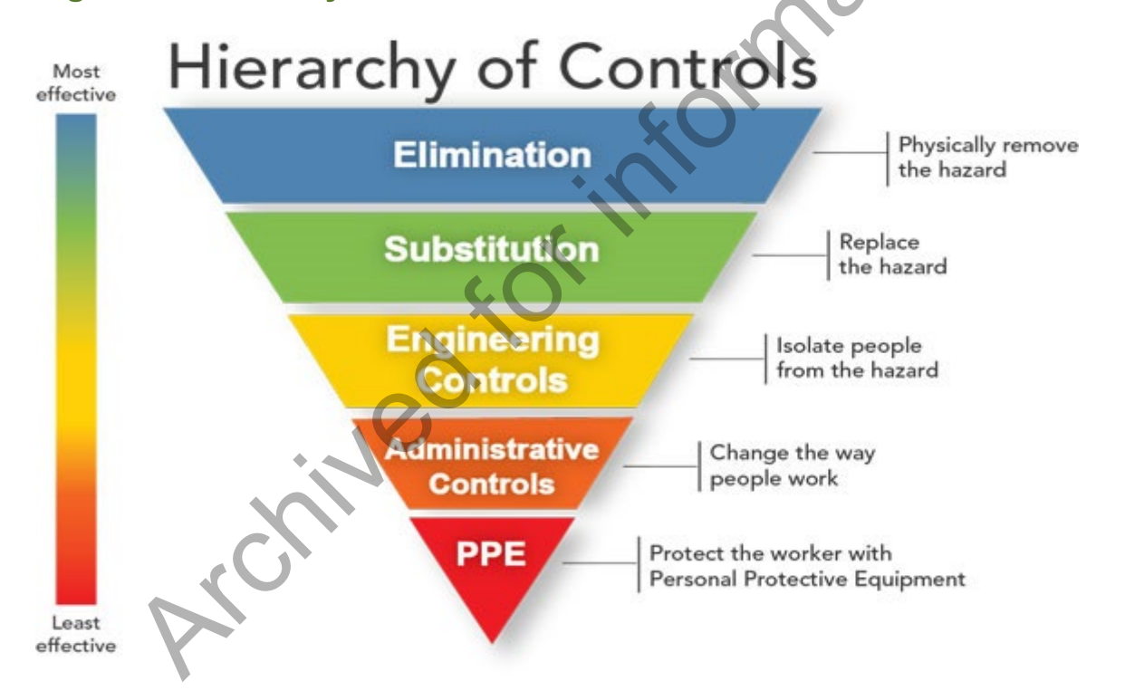
Figure 1: Hierarchy of controls

Centers for disease control and prevention. The National Institute for Occupational Safety and Health. Hierarchy of Controls. 2015. <a href="https://www.cdc.gov/niosh/topics/hierarchy/default.html">https://www.cdc.gov/niosh/topics/hierarchy/default.html</a>